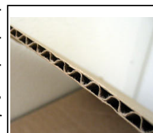
A CLOSER LOOK AT CORRUGATED CARDBOARD.

CARDBOARD DUMPSTER: This is only for corrugated cardboard. You will need to break down the cardboard in order to fit it into the slots. Corrugated cardboard is a paper-based material consisting of a wavy piece, and one or two flat outer pieces; it is not for cardboard similar to cereal boxes.